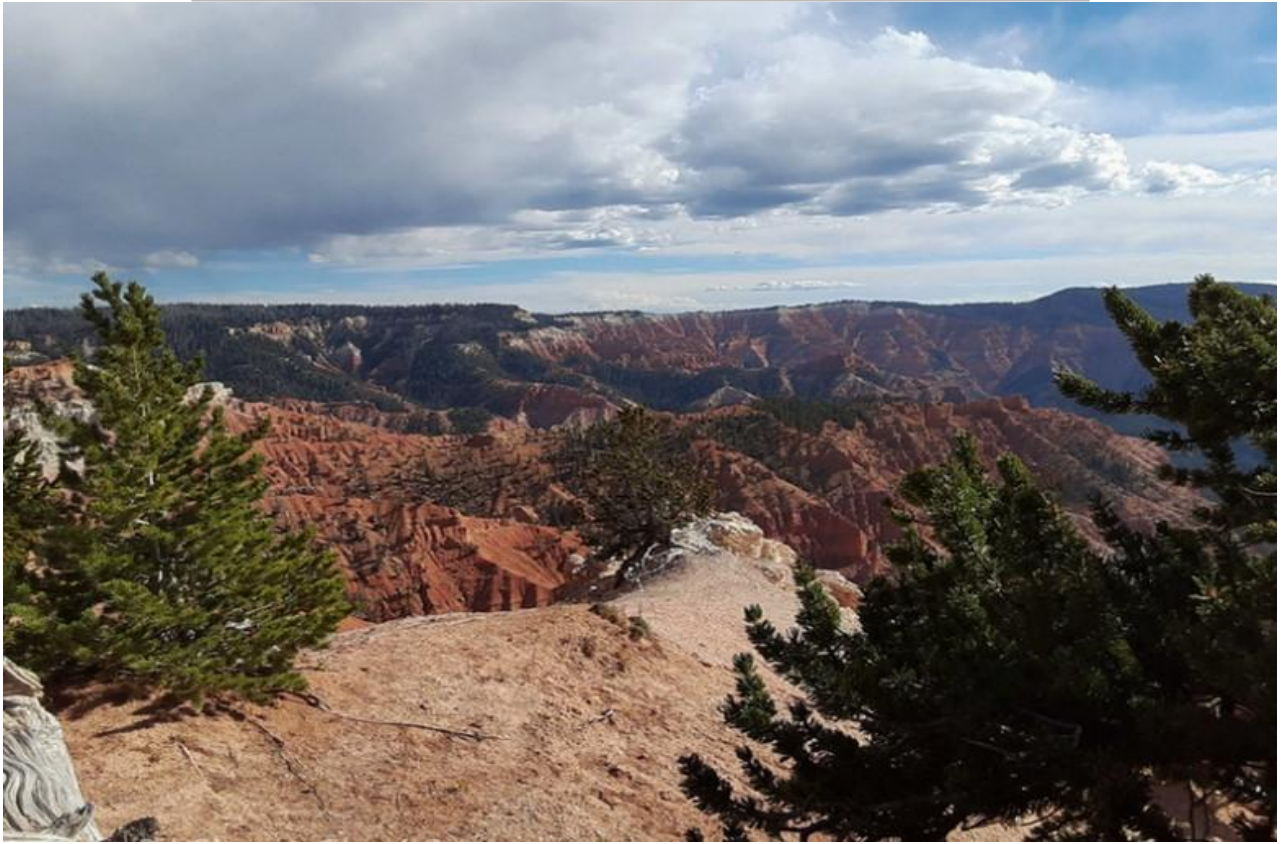
Hiking Rattlesnake Trail, Dixie National Forest