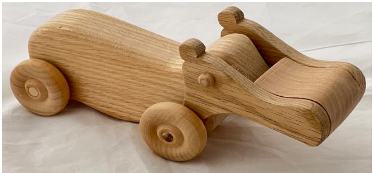
Reiner Jakel hippo pull toy