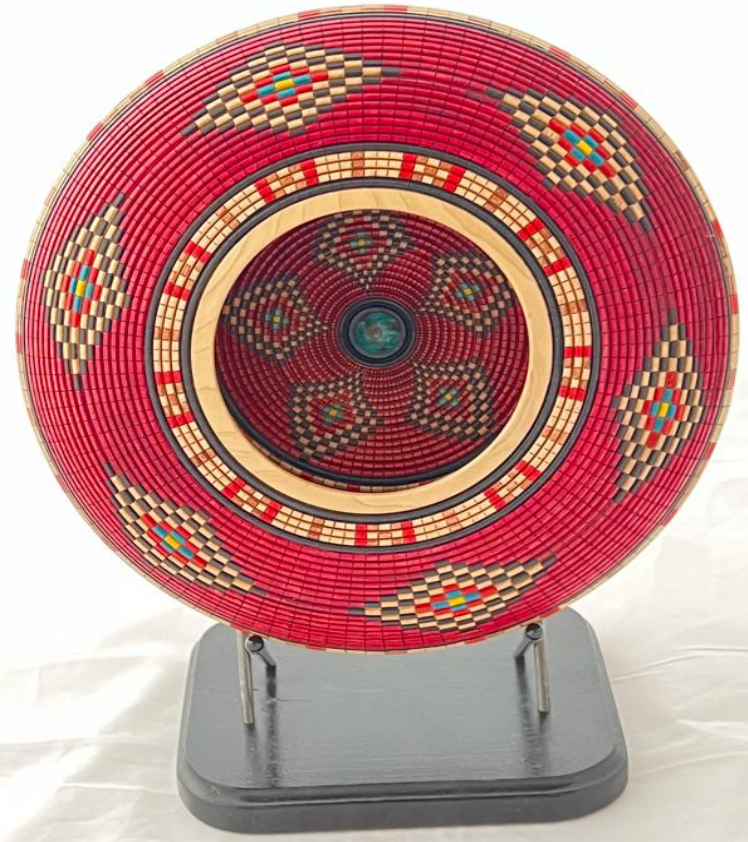
Ken Ragsdale two basket weave bowls