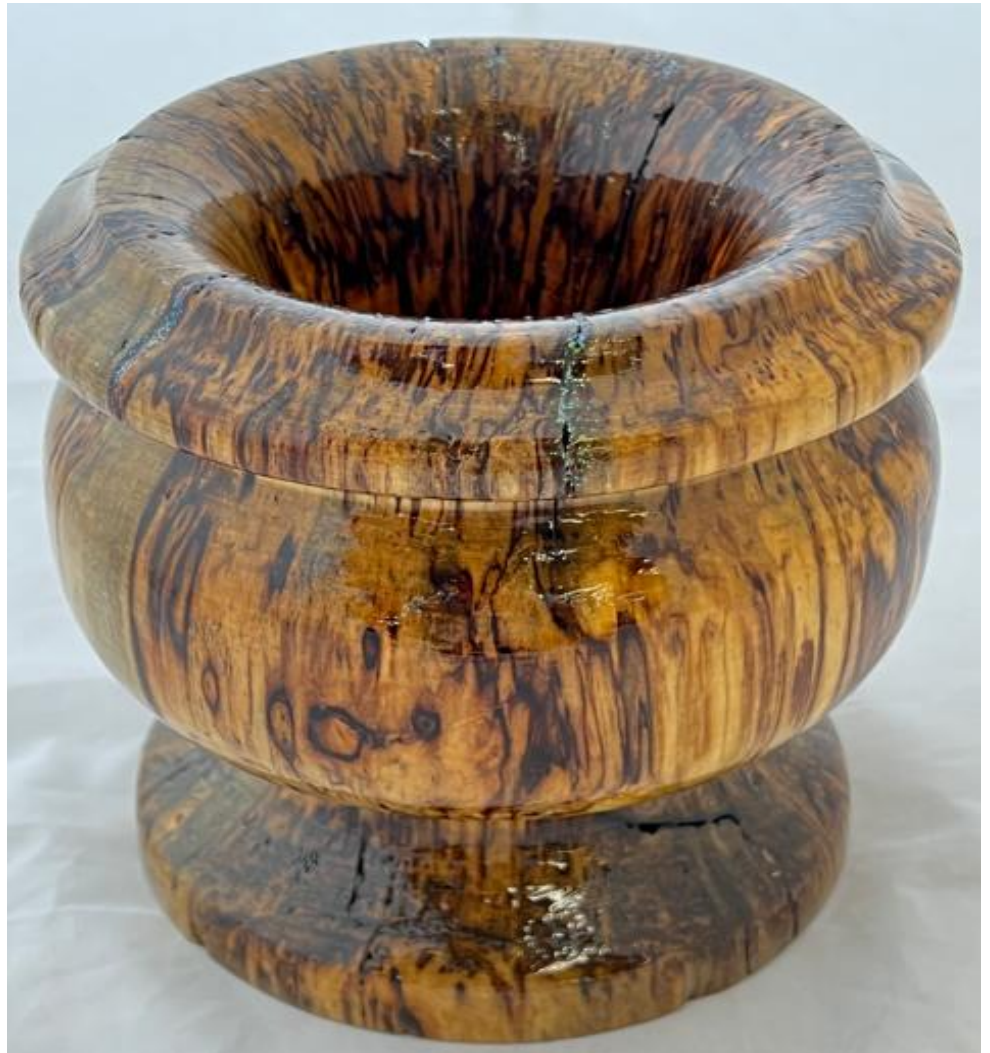
Vernile Prince spalted white birch vase