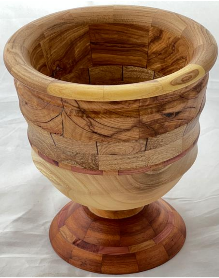
LaVar Hadley segmented vase