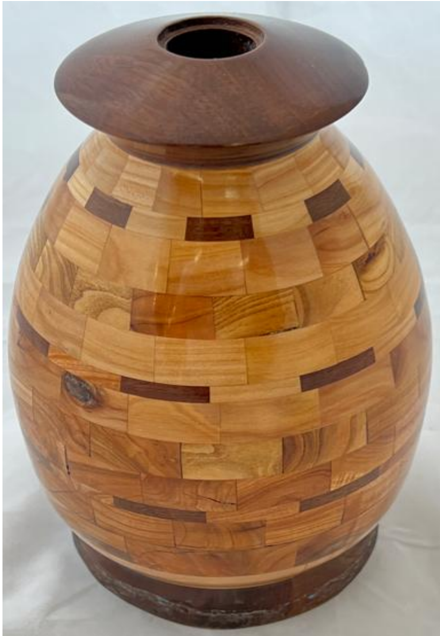
Bob Stringham segmented vase and lidded box