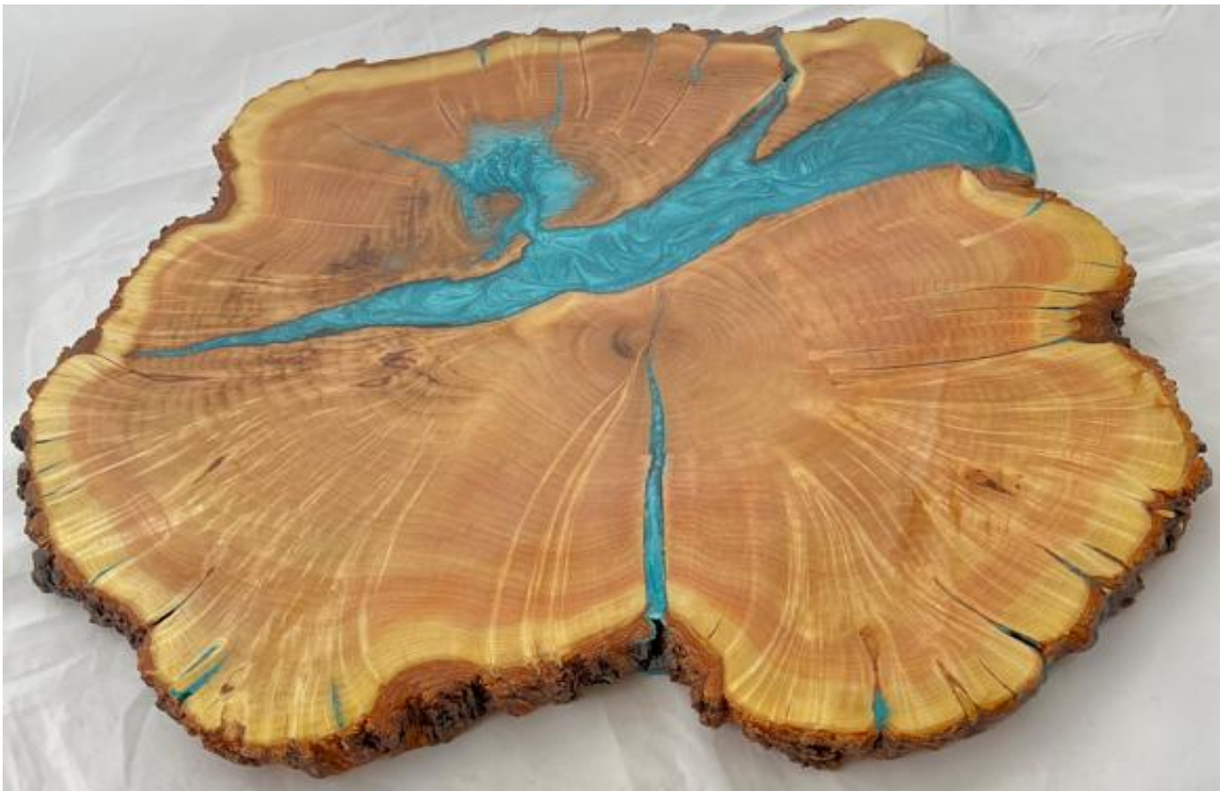
Barry Gray tamarisk Lazy Susan