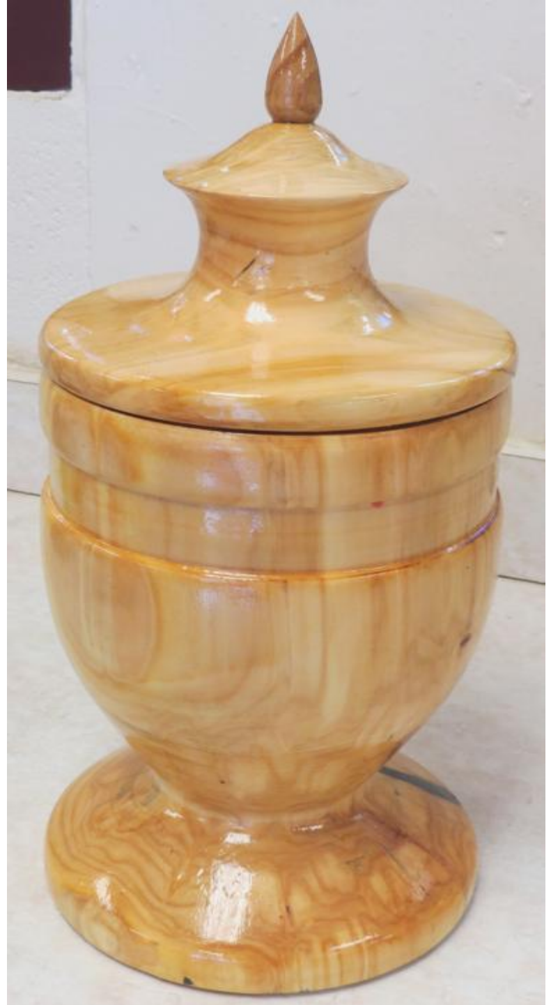
Vernile Prince Silver maple lidded vase