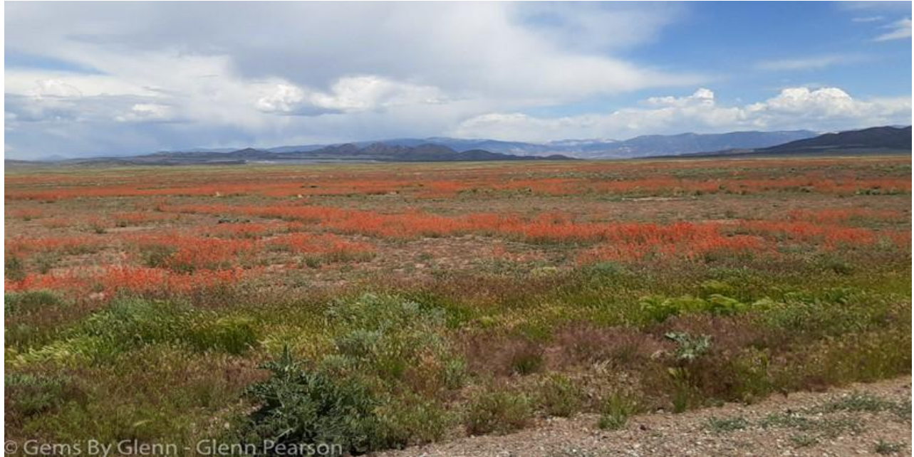
Globe Mallow super bloom