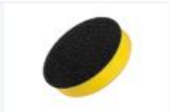
Roloc Foam Pad Disc Holder, 3-inch