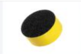
Roloc Foam Disc Holder, 1.5-inch