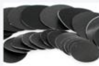
Sanding Pad Holder Repair Discs