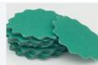
Green Wave Sanding Disks, 3-inch (oversized) - Sample Pack