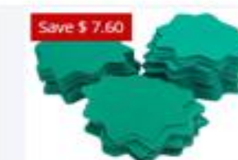
Green Wave Premium Pack 2", 200 Disks