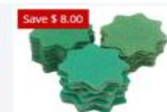
Green Wave Premium Pack 1", 200 Disks