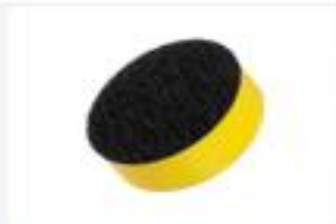
Roloc Foam Pad Disc Holder, 2-inch