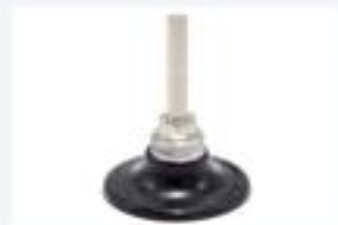
Roloc Mandrel Stem, 2-inch