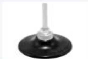
Roloc Mandrel Stem, 3-inch