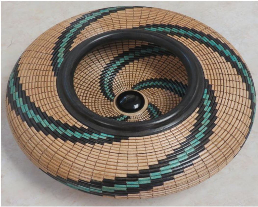
Jerry Keller inside outside beaded illusion hollow form