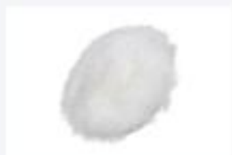
Knitted Wool Buffing Pad - 2" hook and loop mounting