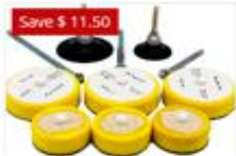
Ultimate Hex Sanding Bundle