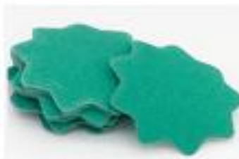
Green Wave Sanding Disks, 2-inch (oversized) - Sample Pack