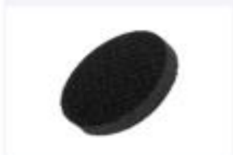
Intermittent Hook & Loop Pad, 3-inch