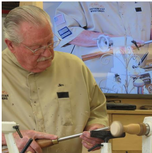
Turning the roof and screwing an eyelet into the roof