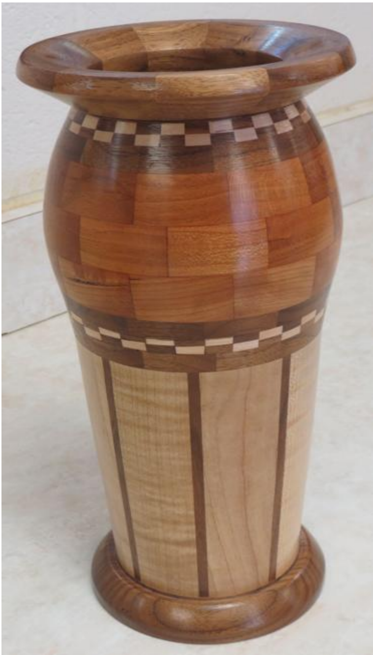
Jeff Blonder Tall segmented vase made with walnut, maple and mahogany