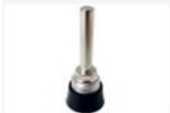
Roloc Mandrel Stem - 1-inch (30mm)