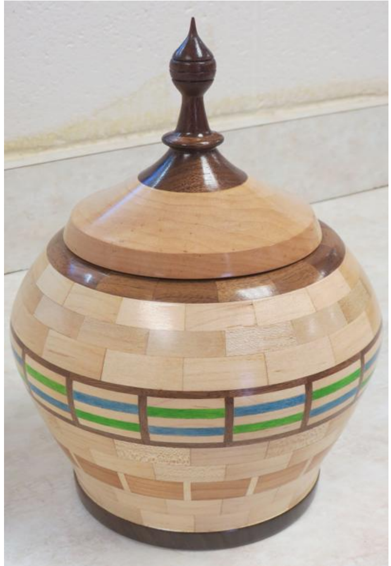
Don Smith Segmented lidded vase, colored with India ink pens