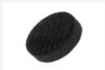
Intermittent Hook & Loop Pad, 2-inch